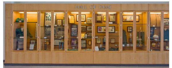
Athletic Hall of Fame Class 201